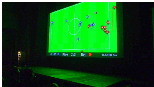
Figure 1: A massive multiplayer soccer game was implemented on the basis of M 3 framework. 17 users play concurrently on a large public display using their mobile devices.