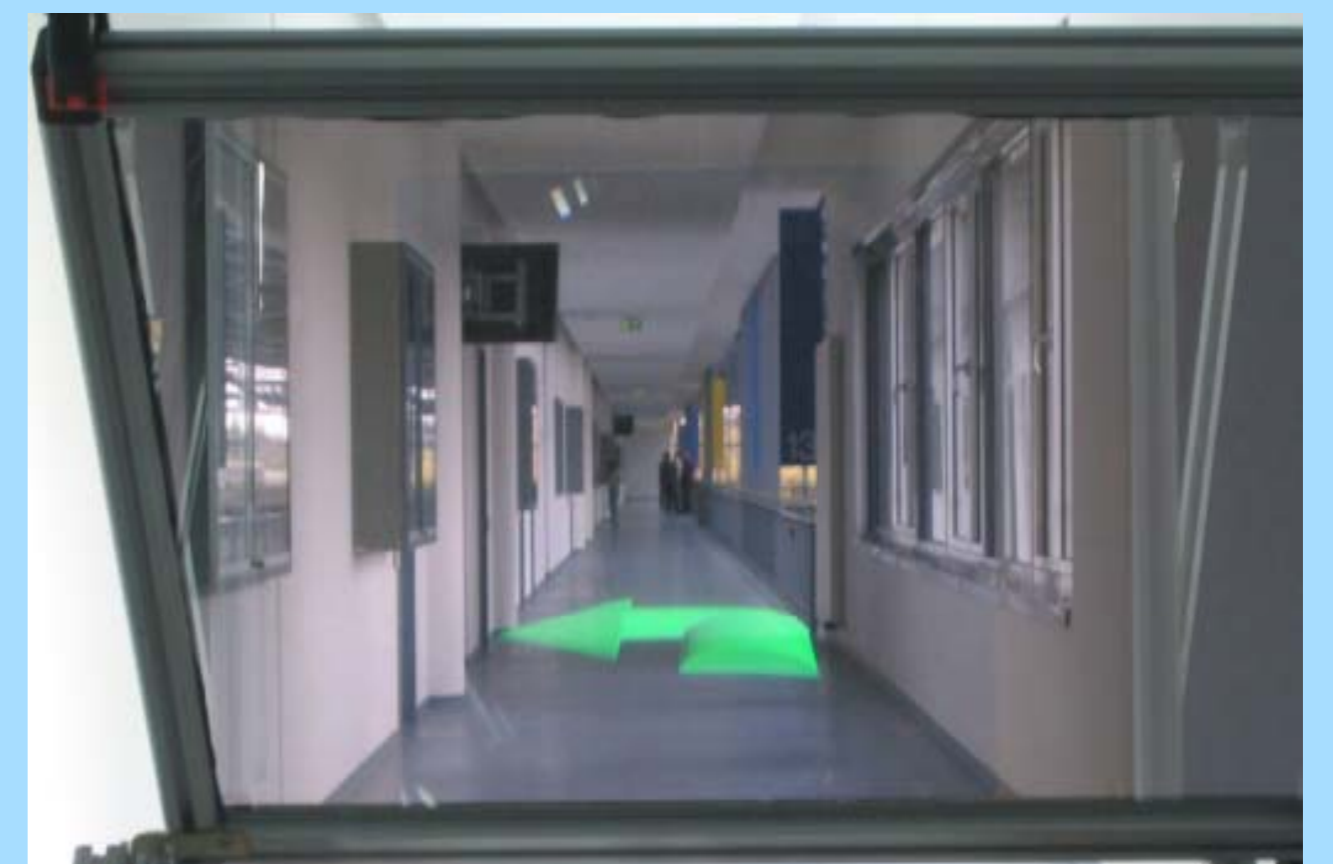
Generated superimposed AR image