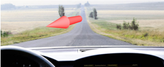
Figure 2. 3D arrow in front of the car pointing towards the position of imminent danger

The second visualization scheme presents a 3D arrow (figure 2). Its back end is placed about 3 meters in front of the driver in height of a typical driver's head. The front end points in the direction of the imminent danger.