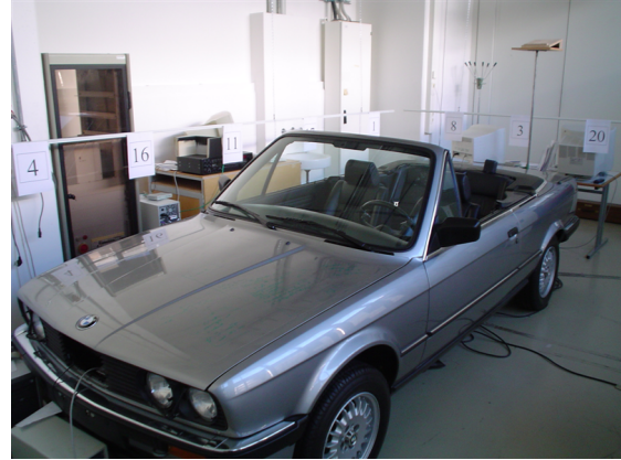
Figure 3. Driving simulator, surrounded by numbered sheets at eye level

during the simulation. Simulated traffic scenes are shown on a planar screen at a focal distance of 3 meters in front of the car driver. The HUD-based visualizations are shown by a second appropriately calibrated projector on the same screen 1 . The simulation covers a 50-degree visual field of view.