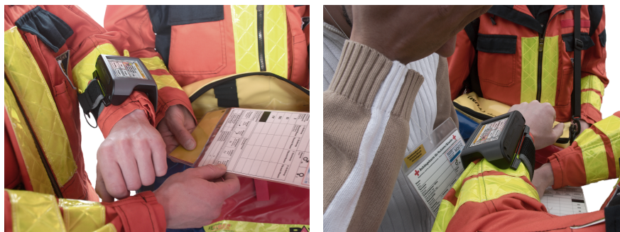
(a) Implementation on the Zypad

The central element of RFID_{double} – the first alternative – is the dual scanning of the RFID-chip. In order to start the triage process the RFID enhanced patient tag has to be scanned with the mobile device. In the mobile user-interface all on the RFID-chip available information can be accessed. The dialog facilitates the selection of the triage category, whereas the pre-defined triage category is already pre-selected. This pre-definition of the RFID-chip is similar to the pre-definition of the paper based colored bar. In the case that the pre-defined triage category conforms to the actual triage category the information is confirmed by a second scan of the RFID-chip. The triage dialog is automatically stored and closed by the second scan. In the rare case that the triage category has to be changed, the user can set the right category by interaction with the touch-screen of the mobile handheld device. Consequently the triage with RFID_{double} consists of four steps: (1) hold the patient tag in front of the mobile device, (2) check the triage category on the display of the mobile device, (3) change category if necessary and (4) hold the patient tag in front of the mobile device a second time.