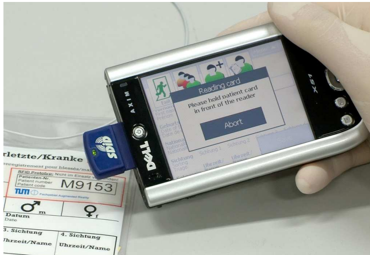
Fig. 2. Reading REPTs with the mobile RFID reader

We suggest the combined, well balanced, use of both paper based patient tags and RFID based patient tags. The resulting RFID Enhanced Patient Tags (REPTs) are physically identical with the paper tags that are already well known to the relief units. Additionally, the tags carry an RFID chip in the upper right corner under the unique id of the paper card. The relief units can access information on the chip by placing a mobile device next to it (see Figure 2).