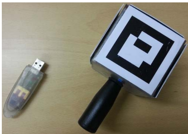
Figure 2. Wireless solution of a haptic prototype for the Augmented Chemical Reactions application.

Inside the pattern cube the electronic board and a vibration motor was mounted. Fig. 3 depicts the developed electronic board.