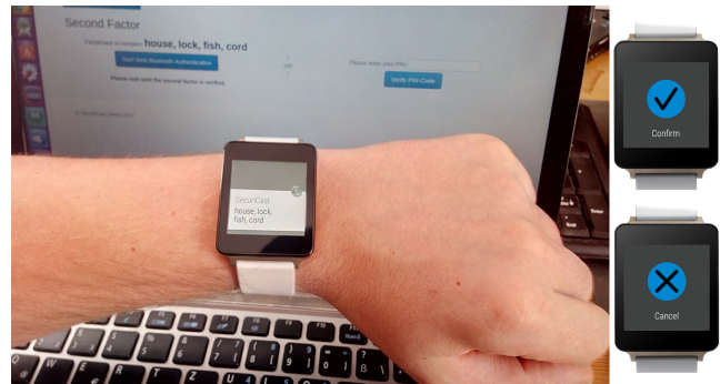
Figure 1: Using SecuriCast in notify mode to confirm two-factor authentication via a smartwatch.

Access to today's ubiquitous web services is mostly controlled by a single authentication factor, usually in the form of a username/password combination. Given that a single