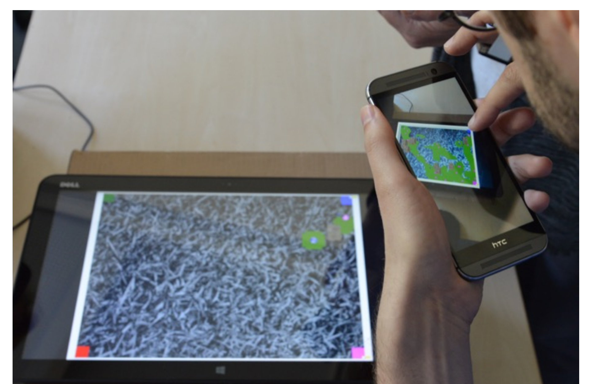
Figure 6. The user is trying to move the player to the top right corner of the board

The merits and drawbacks of each method were considered to ultimately choose the first option. However, further testing may need to be conducted to determine how well the different options test.