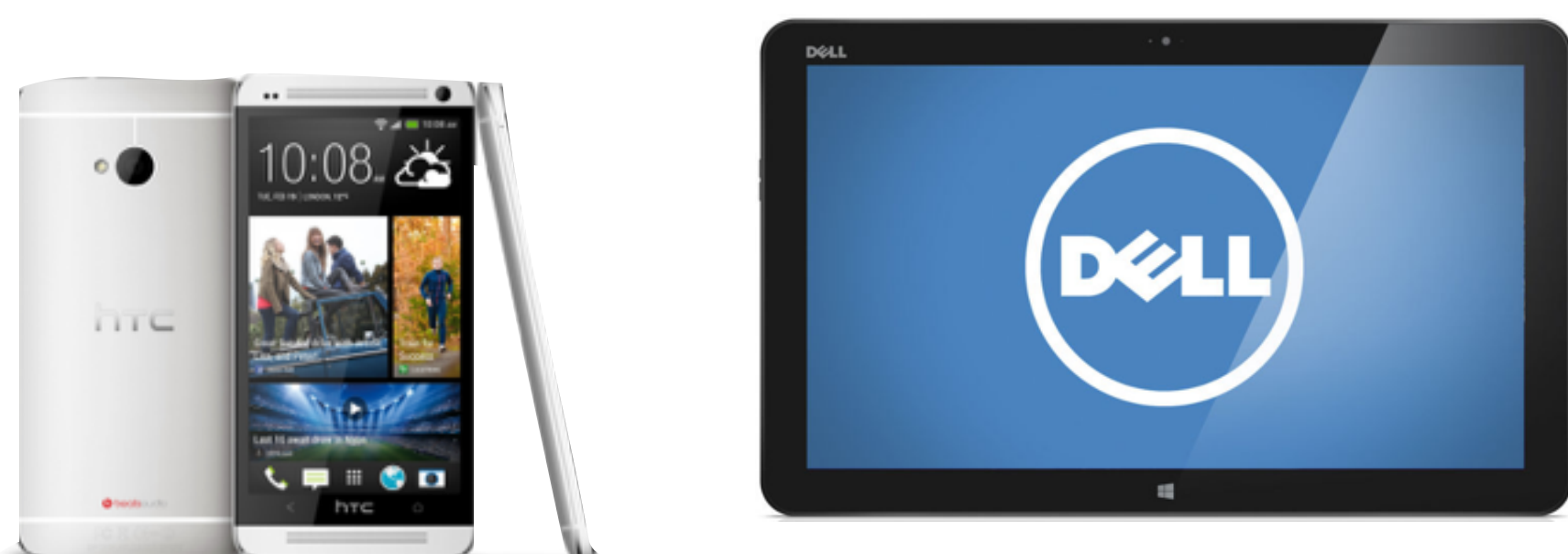
Figure 2. The hardware used as the platform for the Capture the Flag game.

In order to investigate the possibilities to engage the user with multiple devices, a Capture the Flag game was implemented. The game was created to be run using a XPS 18 Windows Multi-touch Tablet and 2-4 Android smartphones.