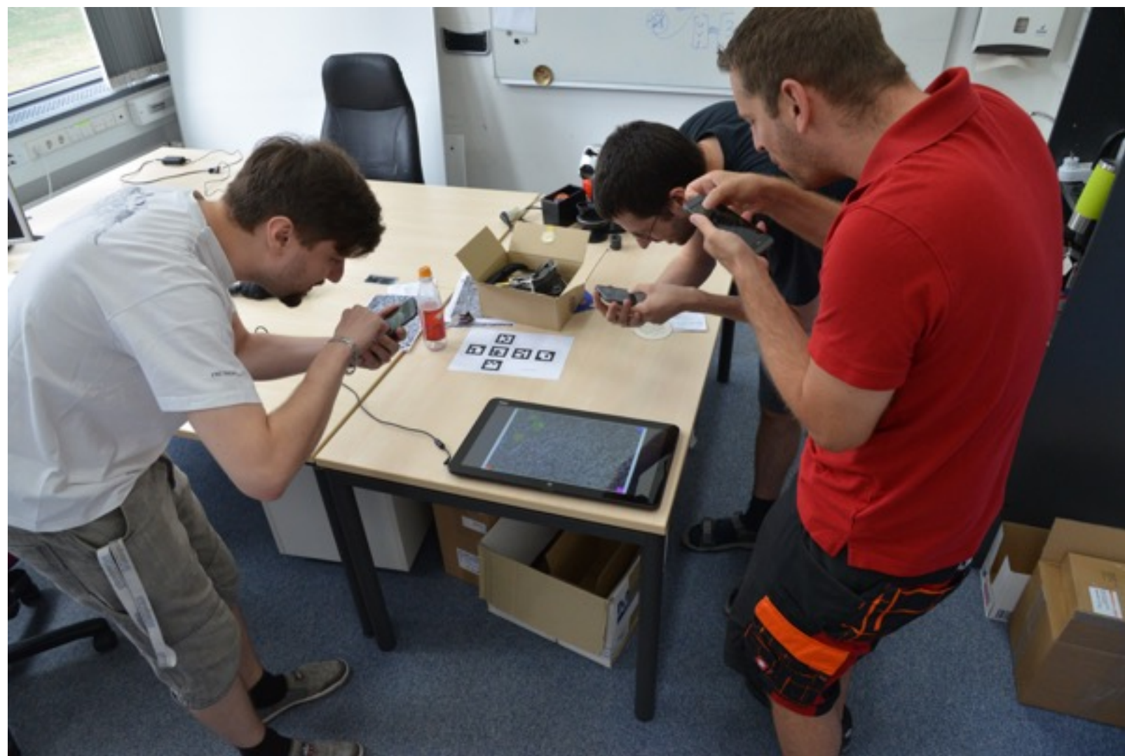
Figure 1. Three players playing the Capture the Flag game.

This project challenges the traditional setup of a multi-player game and examines the possibility of engaging a group of players in a single game, while still allowing the possibilities that a computer or video game provides. It uses Augmented Reality (AR), an indirect view of the physical world, to provide each player with his or her own information unavailable to other players. Augmented Reality involves “augmenting the real world with computerized information” [1]. In this case, the real world is locked on top of a shared tablet screen that displays certain aspects of the game to users. This project experiments with different information being displayed on different devices to highlight important information.