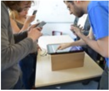
Figure 2. Players playing capture the flag on a tablet. The player in the front right is tapping on the table to steal the flag. The players on the left are moving by touching on their smartphones and are blowing into the microphones.

The game begins with each player at their own base. The players can gain the view of the playing field on their devices by pointing the smartphone's camera at the tablet. The Vuforia system can recognize the target, and the objects will appear as a 3D representation over the board. Each player can then move by touching the target location on the game world representation on his or her smartphone. The player can also blow into the microphone on his or her smartphone in order to move faster.