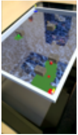
Figure 4. Screenshots from the tablet and the smartphone. The first shows three players on the tablet, where one is carrying the flag. The other shows the the green area and obstacles covered by the red player on the smartphone, information that is invisible on the tablet, as well as the 3D augmentation.

as soon as the player moves from the position, this disadvantage is negligible since players are often focused on other things and will not remember every location where a trap is placed.