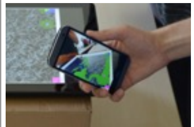
Figure 1. The game was developed to be played on a large multi-touch tablet and multiple smartphones.

group of players in a single game, while still allowing the possibilities that a computer or video game provides. It uses Augmented Reality (AR), an indirect view of the physical world, to provide each player with his or her own information unavailable to other players. Augmented Reality involves “augmenting the real world with computerized information” [2]. In this case, the real world is locked on top of a shared tablet screen that displays certain aspects of the game to users. This project experiments with different information being displayed on different devices to highlight important information.