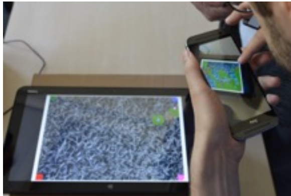
Figure 3. A player trying to move toward the upper left corner of the board using movement method 1.

3. With the camera focused on the tablet, the user can then focus the center of the camera to a particular location in the game world. The player will then move towards the location that the player is focusing on.