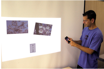
Figure 3: User interacts with his mobile phone and the interactive surface.

a mobile phone above a picture and pressing the copy button in the AA. This will show the previously generated marker on the display of the mobile phone until it is detected by the ISA. The ISA then sends the picture and as soon as the mobile phone receives the data, it will show the pictures menu again. If a user wants to leave, the user can simply quit the AA which will send a farewell message to the ISA. The visual representation and all data coming from the corresponding phone will be removed from the interactive surface and the locked marker ID will be available again for another phone.