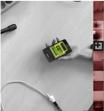
Figure 2: Detected Marker on Mobile Phone in RGB Image.

The next step is to combine the information of a marker with an object blob of the depth camera. This is done for each detected marker position by searching for the nearest blob within a modifiable search radius. If a blob is found, the marker information is added to the other characteristics of the blob. If no blob is found in the vicinity of a marker, the system can be adjusted to simply discard the marker or to automatically generate a blob on the projected position on the surface. The position of the generated marker blob won't be as accurate as an object tracked by the depth camera because of the predefined camera calibration. Yet it can still be useful especially if you want to track reflective displays (e.g. mobile phones) which often can't be detected reliably by the depth camera.