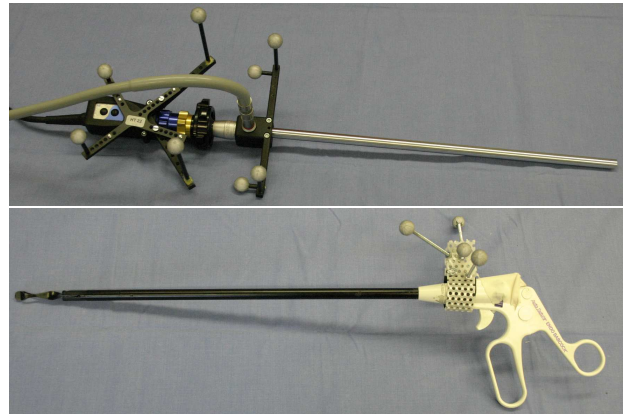
Figure 2: Laparoscopic camera (upper image) & surgical instrument (lower image). Both instruments are equipped with a marker tree to make it trackable by our outside-in tracking system.

the laparoscopic camera by a plastic foil and scanned the whole phantom with a CT imaging device. The visualization of the two branches registered with the phantom is separated virtually by clipping planes. During the experiment the box is closed with a wooden plate that consists of twelve holes for each branch used as ports to the inside of the box. After the CT scan we defined 5 spots for each volume, which are visualized as a sphere colored slightly different than the visualization of the branches.