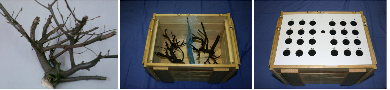
Figure 3: Two wooden branches are installed on the bottom of the box. The closed box provides twelve ports to each branch.

one branch while working with the first visualization mode and using this knowledge for the second visualization mode. The AR scene is presented on a monitor positioned in the working space of the subjects as shown in figure 5. Every subject had to reach five spots for each of the two branches. For every target spot, we predefine one of 12 ports, which has to be used for the laparoscopic camera. The selected ports only provide a restricted view on the target spot due to self occlusion of the branches. The surgical instrument can be inserted through an arbitrary port. The combination and order of branches and the visualization mode changed for every subject. When subjects reach the target spot they ask the investigator to lock the result to measure time and accuracy. Overall 12 surgeons participated and 60 spots were analyzed. Before a subject starts the experiment, we provide the following information: