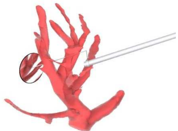
Figure 4: Illustrative view on the mirror attached to the camera.

The experiment compares two visualization modes ViNoMir (augmented branches) and ViMir (augmented branches including the mirror). For ViMir , the mirror is installed 165mm in front of the endoscopic camera and oriented 45° towards the point of view (figure 4). The mirror can be placed at four different positions (left, right, top, bottom), whereupon the center of the mirror is moved orthogonally 70mm away from the view axis of the laparoscopic camera according to the respective position. The virtual mirror reflects the visualized branches as well as the virtually extended surgical instrument. The background of the reflected scene is black. A textured cylinder connecting the mirror with the camera provides visual cues about the spatial position of the mirror respective the camera position. The reason for the evaluation of two visually sep-