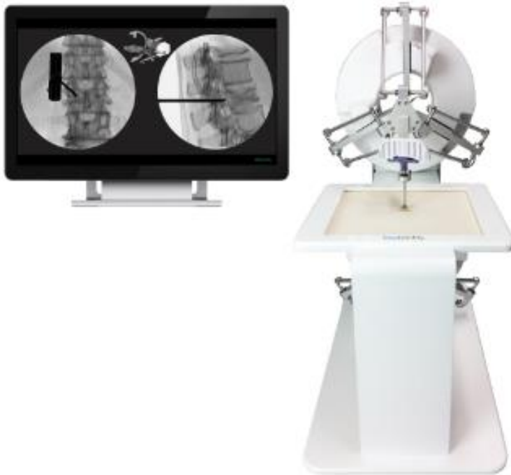
Simulation setup [1]